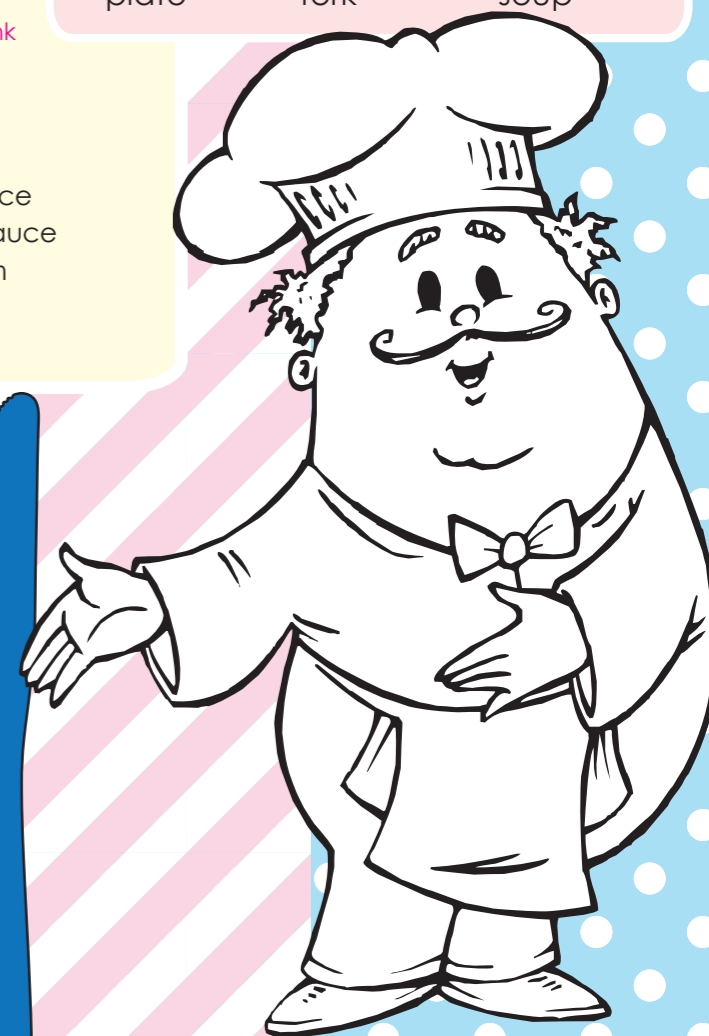
COLOUR IN OUR HEAD CHEF MONSIEUR SAVILLO SPAGHETTINI